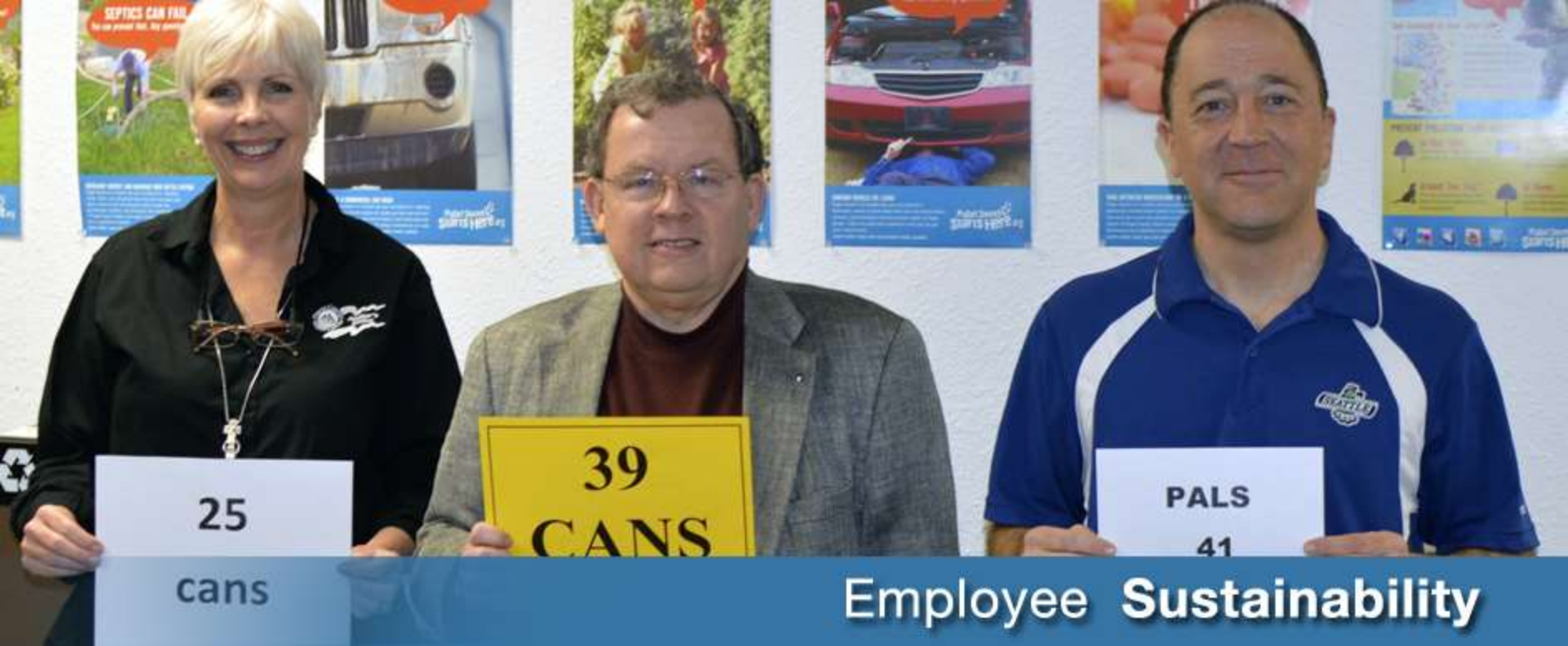
Percent of Pierce County Employees that consider sustainability at work